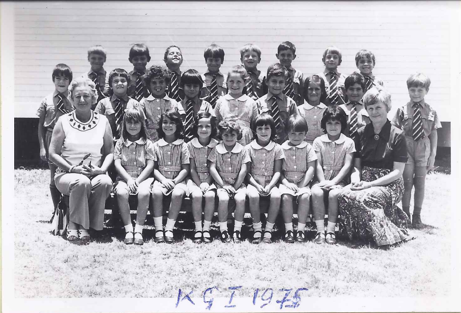
K 9 I 1975