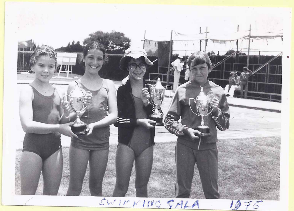
SWIMMING GALA 1975