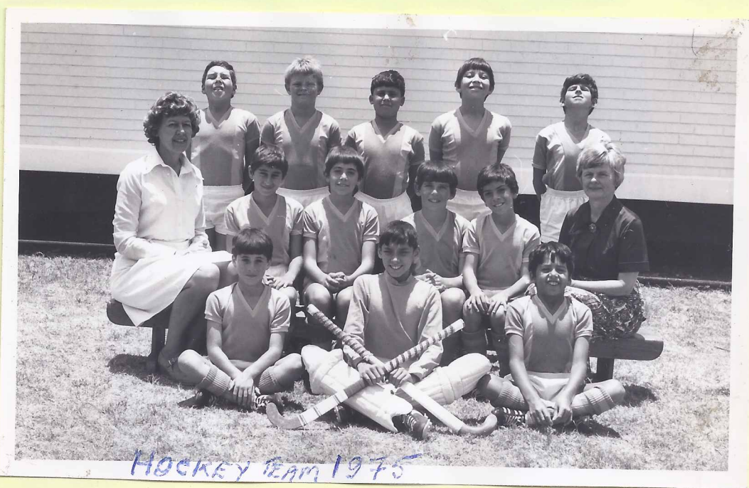
Hockey Team 1975