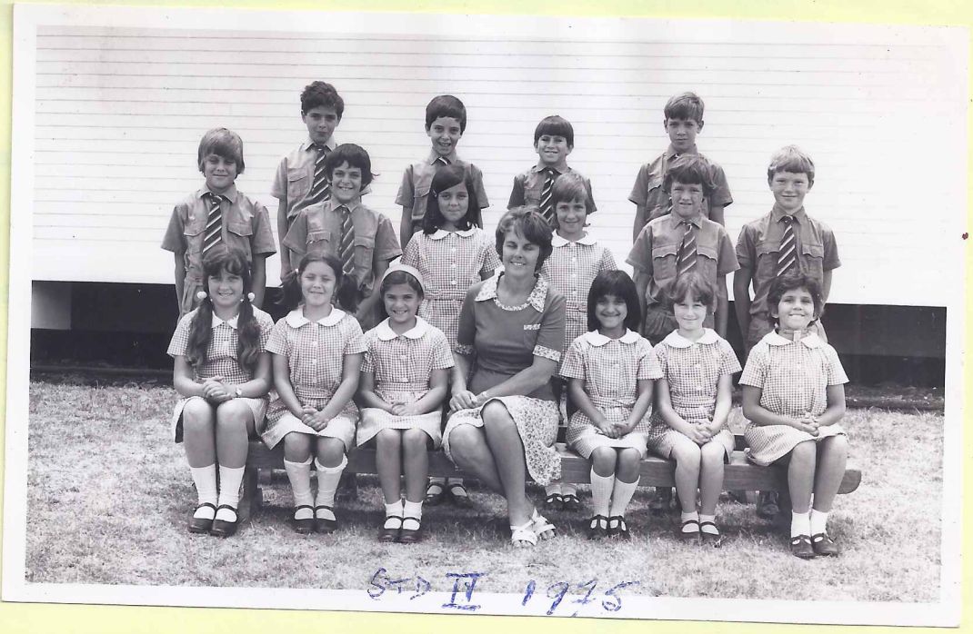
5-2 II 1975