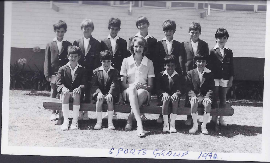
SPORTS GROUP 1974